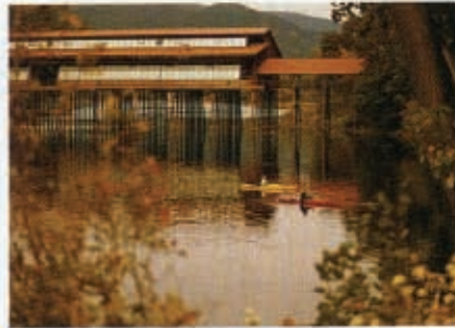
A spellbinding setting beside Lake Pend Oreille (far left) makes Sandpoint a magnet for vacationers—and new residents—from around the West. At left, kayakers paddle near Sandpoint's Cedar Street Bridge.